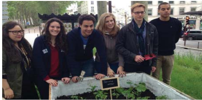
Versailles Rotaractors and friends launch a Potalib project in Vélizy-Villacoublay.

Mathieu says that people readily take responsibility for maintaining the vegetable gardens and no instances of theft, hoarding, or vandalism have been reported. Instead, Potalib is bringing communities closer together.