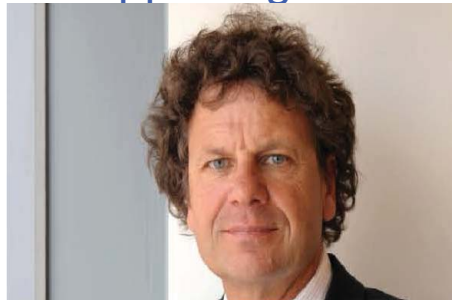
Simon McKeon AO Rotary Club of Rosebud-Rye 13th May 2014