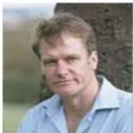
William McInnes Actor/Author